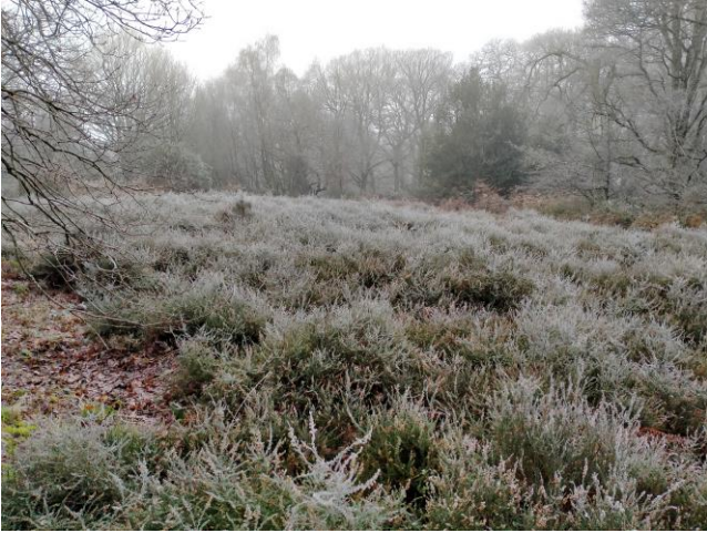
Frost over the Heather Glade