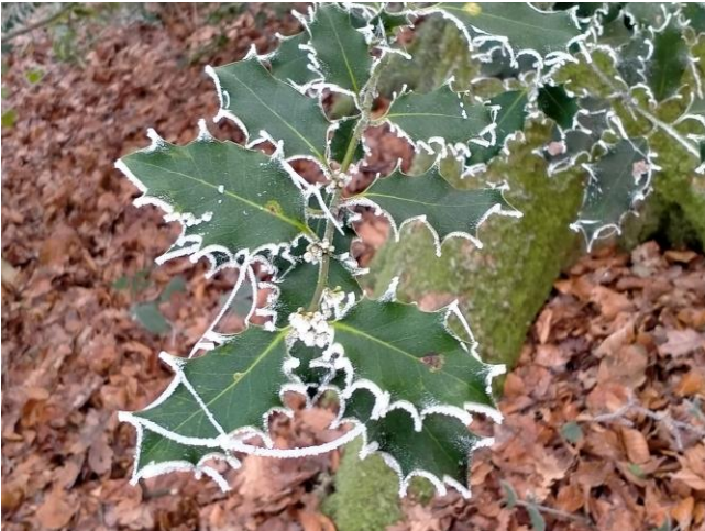
Cold Holly leaves