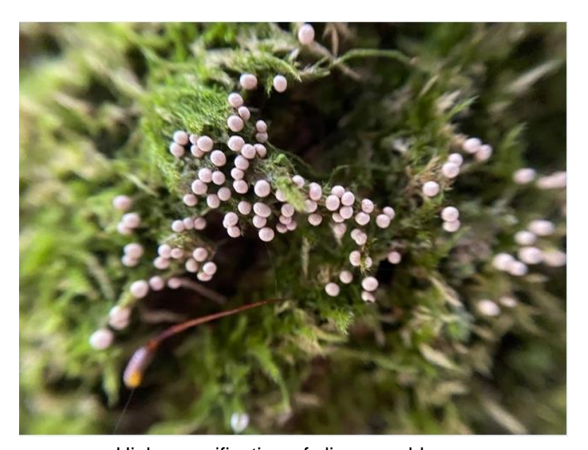
High magnification of slime mould