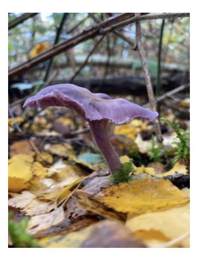
Amethyst Deceiver (Laccaria)

Blue-Green Open Wood Cup (Chlorociboria)